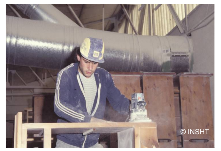
Young worker exposed to wood dust

Some of the most common exposures experienced by women in the CAREX studies that addressed gender were diesel engine exhaust, solar radiation and ETS, which are poorly covered by registers, although they are very relevant to a wide range of occupations and sectors.