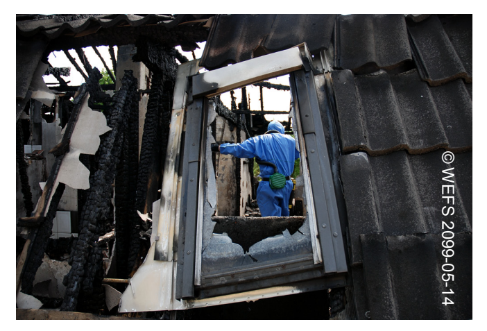
Asbestos removal work after a fire

Surveillance systems for occupational cancer are helpful for assessing national and regional risks, and they improve identification of suspected cases of occupational cancer, as well as being useful in the legal compensation process. Examples of such systems are the French Scientific Interest Group on Occupational Cancer (GISCOP), which incorporates a retrospective exposure history assessment for workers affected by cancer through interviews and social security and employment data, and the Italian Occupational Cancer Monitoring (OCCAM) project, which actively seeks information on victims of occupational cancer by following up on high-exposure histories of workers.